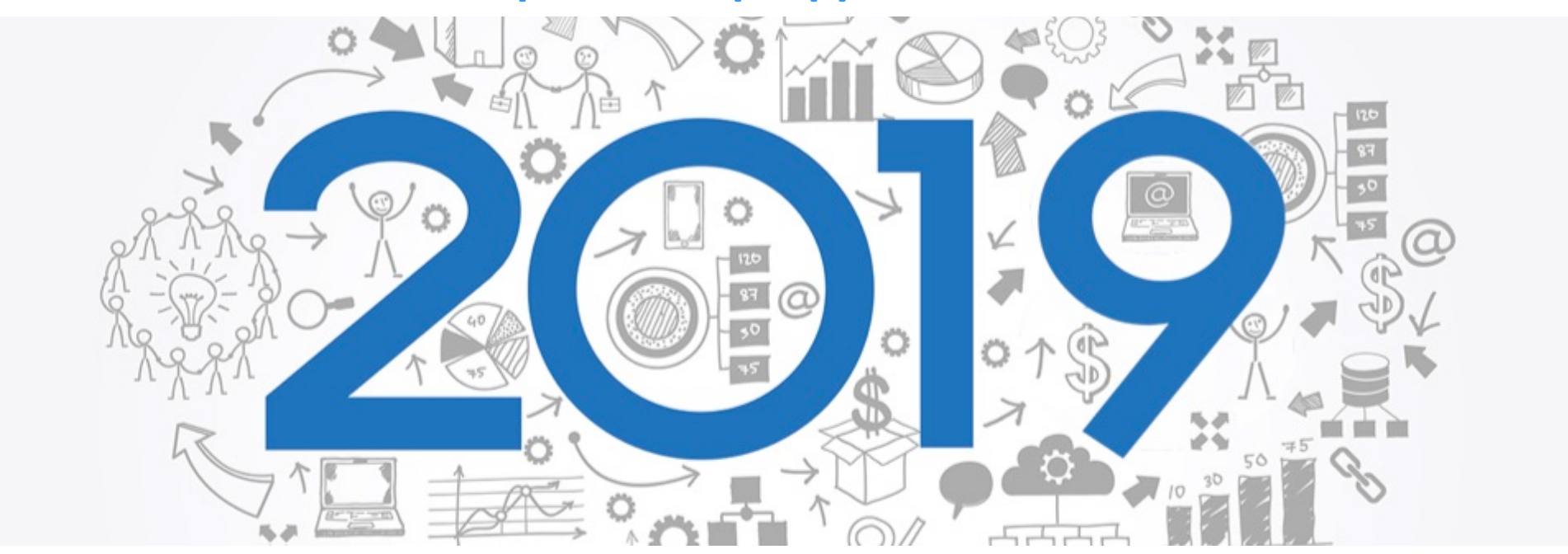
There's a level for everyone

Professionals who leverage EEBA education are highly engaged and motivated to learn, share and experience new ideas. Use the following sponsorship opportunities to make an immediate impact with sustainable building leaders.